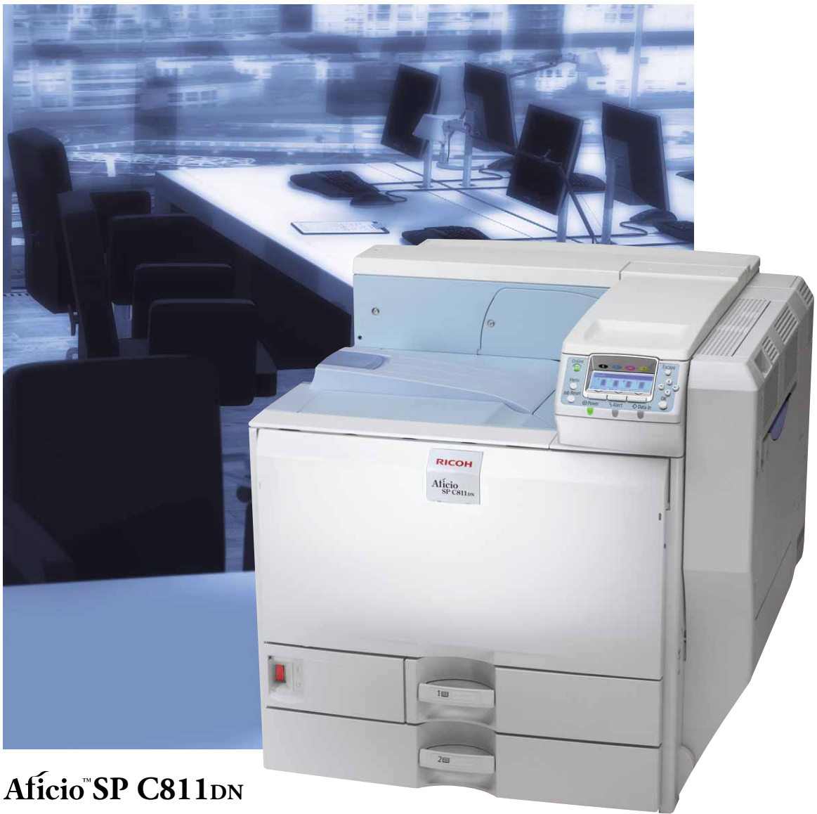
Aficio™ SP C811DN