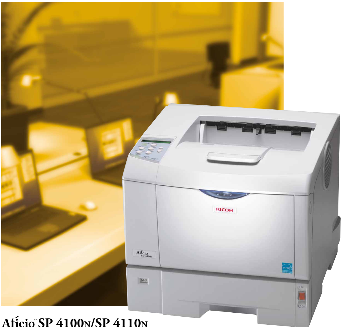
Aficio™ SP 4100N/SP 4110N