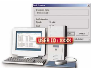
Online authentication & print cost preview

Equitrac Office™ features a flexible architecture to meet the needs of any environment. Two versions are available offering licensable modules: the Equitrac Office™ Suite and the Small Business Edition. General offices, government agencies, educational institutions and other organisations can now be more efficient and productive while containing and even lowering operational costs.