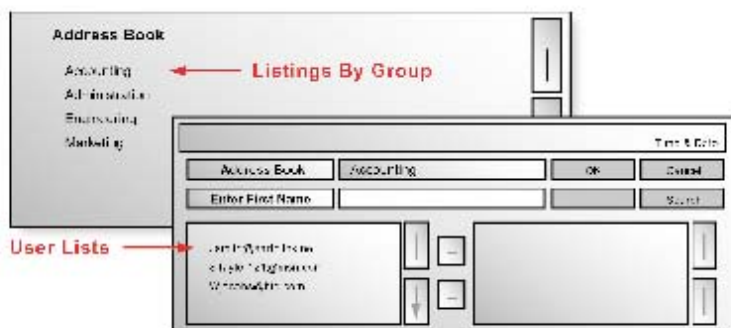
Using GlobalScan Server you can enter an unlimited number of addresses from your company's global address book and/or multiple databases.