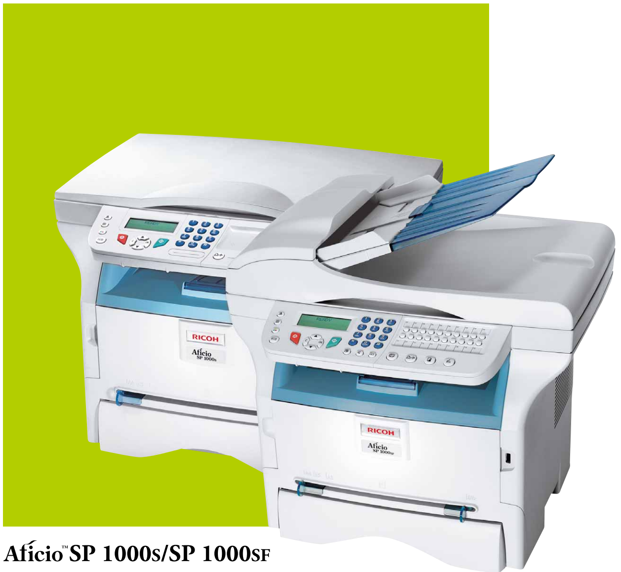
Aficio™ SP 1000s/SP 1000SF